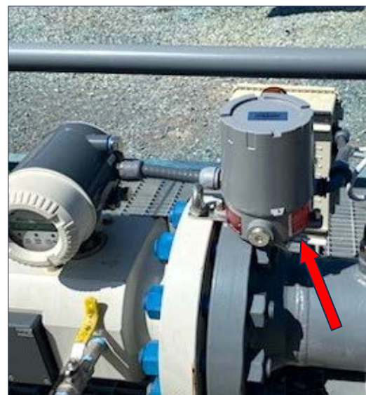
A ZeroDT S-4 surge protection junction box providing protection for equipment.

⚠ WARNING EXPLOSION HAZARD: Do not disconnect equipment while the circuit is live or unless the area is known to be free of ignitable concentrations.